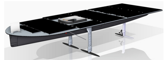
Figure 1: Detailed computer-aided design model of the solar boat.

Our aim is to raise awareness of the possibilities of renewable energy sources and to create an infrastructure and knowledge base that helps newer generations take part in electric vehicle development projects.