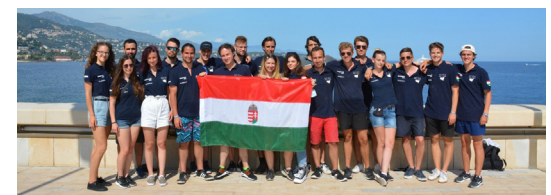
Figure 4: BME Solar Boat Team in Monaco, 2021

ANSYS, Inc. www.ansys.com ansysinfo@ansys.com 866.267.9724