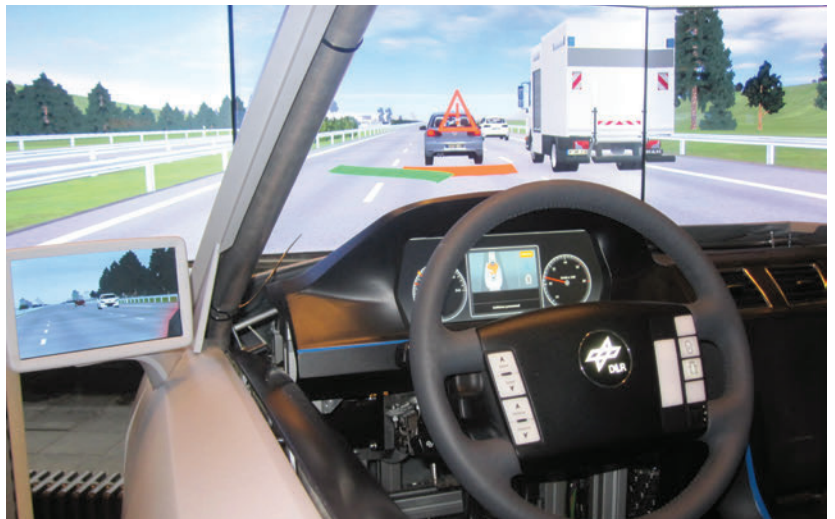
▲ HMI on heads-up display for highly automated driving

One example of how the HMI operates occurs when the automation system cannot sense the lane markings due