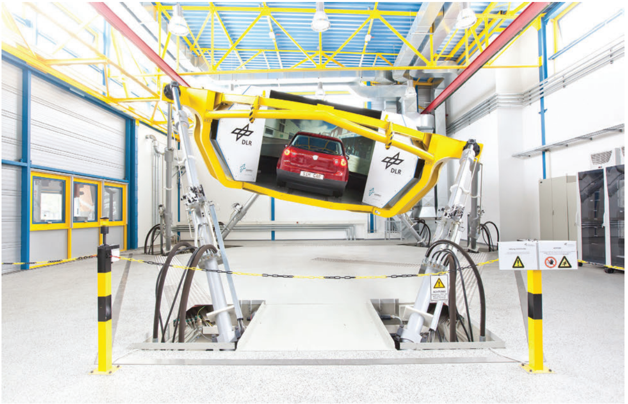
▲ Dynamic driving simulator