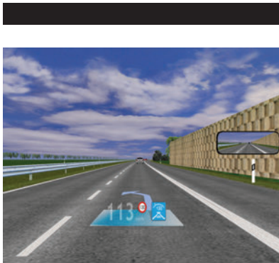
▲ Automated lane change

SCAD Suite and SCAD Display make it easy to modify the HMI to evaluate different alternative designs and to produce different variants of the HMI for different vehicles. DLR engineers can re-arrange the way that elements are positioned on the different displays of a vehicle simply by re-arranging blocks in the model. In the past, this would have required major amounts of manual coding. ANSYS SCAD Suite and SCAD Display have substantially improved the process of developing HMIs by continually testing and validating the HMI, first in the model phase, then in the vehicle simulator and finally in the target environment on the test vehicle, so that problems can be identified and corrected at the earliest possible stage. 🚩